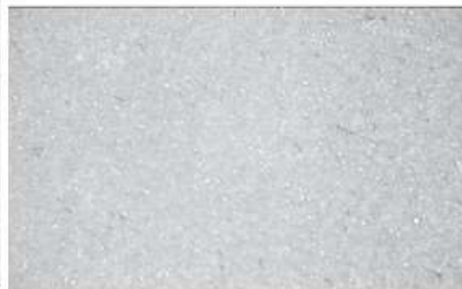
Fig. 4: Microstructure of Cryogenic-treated HSS T 15, S 400 tool at 100X