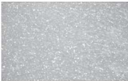
Fig. 3 Microstructure of Non-treated HSS T 15, S 400 tool at 100X

The microstructure analysis of the samples was carried out using metallurgical microscope at a magnification of 100X. There is a noticeable difference in the microstructure of UT and CT. Fig. 3 shows the microstructure of UT sample, which consists of grain boundaries and austenitic structure. Fig. 4 shows the microstructure of CT sample, there is refinement in the microstructure. Grains become refined in the structure and number of carbides precipitates increases after the treatment. Due to refinement of the structure the cryogenically treated samples shows better performance in terms of mechanical and wear properties of the material.